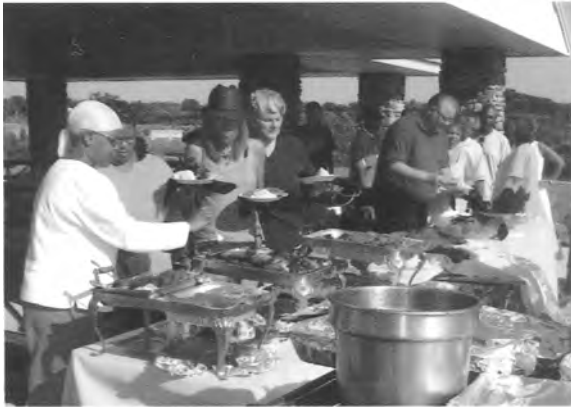
Lots of Good Eating